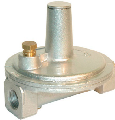
Figure 1: CSA 6.22 Certified Line Pressure Regulator

For indoor regulators, NFPA 54 states that regulators shall be vented outdoors, excluding regulators with vent limiting means listed in accordance with ANSI Z21.80/CSA 6.22. ANSI Z21.80/CSA 6.22 is a harmonized standard for Line Pressure Regulators, also known as appliance regulators, similar to the regulator in Figure 1 below. Z21.80/6.22 defines a Vent limiter as a device that shall limit the flow through the vent of the regulator to 2.5 CFH of natural gas. However, that standard does not apply to most residential and commercial service meter applications as it only specifies inlet pressures up to 10 psig. Additionally, Vent Limiters are typically designed only for indoor service. Instead, most residential and commercial service regulators conform to ANSI B109 standards.